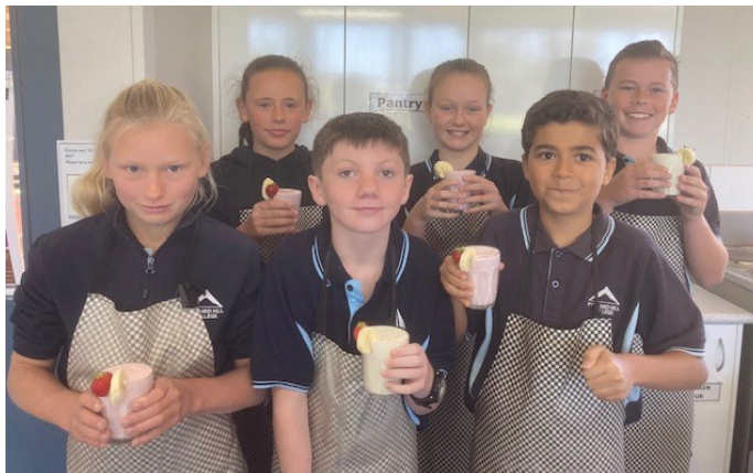
Students in Year 6 during their first Food Tech class