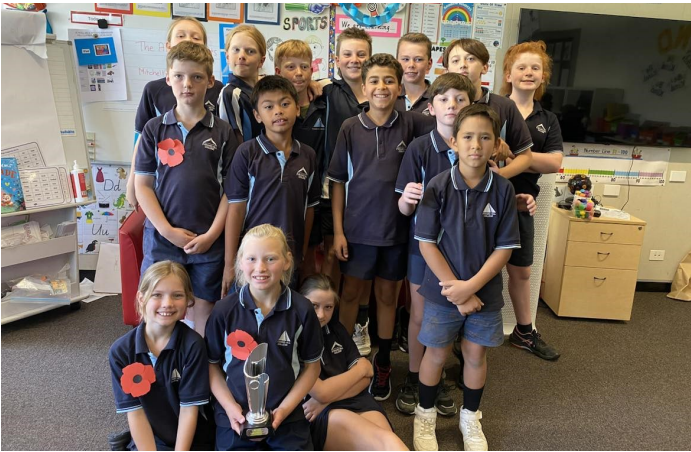
Congratulations to Year 4/5/6 on winning the Classroom Cup.