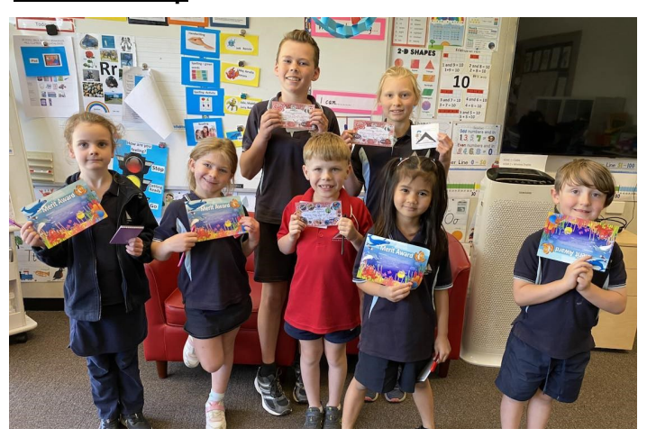
Congratulations to Year F/I on winning the Classroom Cup.